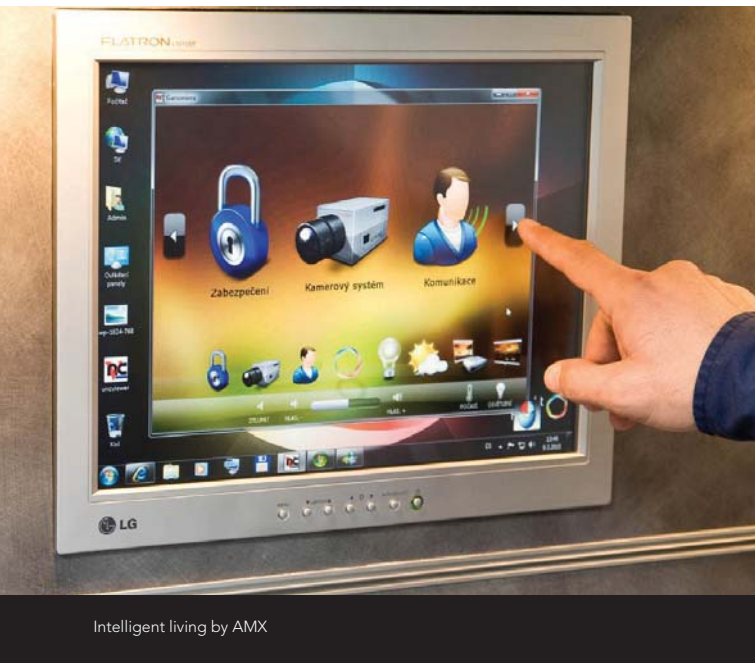
Intelligent living by AMX

Structured cabling is the key to the AMX networked system. All three houses are connected by optical fibre and structured cabling has been included in every room. The individual rooms, garden, grounds and gate are further connected with the use of intercom and VoIP technology.