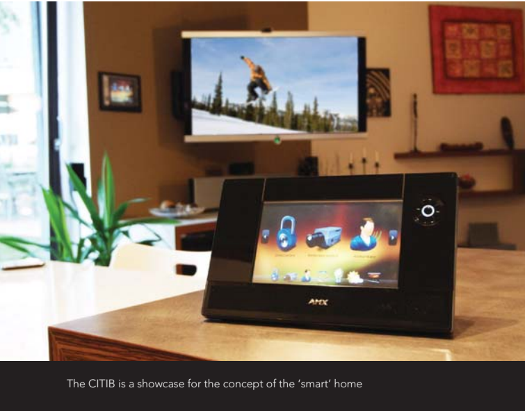
The CITIB is a showcase for the concept of the 'smart' home

Behind the scenes, a high-performance and ultra-fast NI-4100 NetLinx Controller is the brains of the entire AMX solution, allowing the large number of devices and components to become integrated as part of the central control system. Additional control capability is provided with a NetLinx® CardFrame, NetLinx ICSHub Expander Card and 6 x Dual COM Port Card.