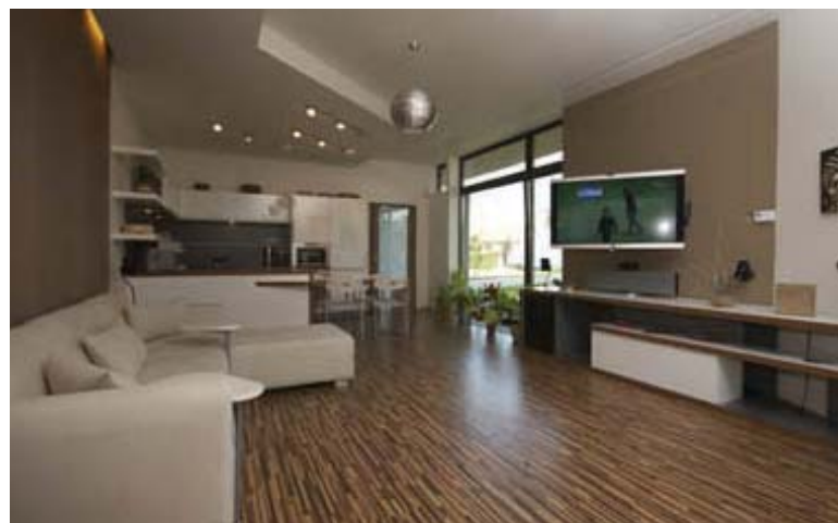
Unified control ensures the CITIB runs at maximum efficiency

The entire CITIB complex is monitored at all times by Panasonic IP cameras which are connected to a Panasonic video server and relayed onto any AMX screen, TV, computer LCD or internet-enabled mobile phone. An AMX Metreau Entry Communicator at the front gates enables one-way visual and two-way audio conversation with visitors. Working over a straightforward Ethernet connection, the discreet Metreau allows occupants to view crystal clear video of a visitor on their touchpanels and TVs, and talk via telephone, mobile wireless touchpanel or their in-wall screen.