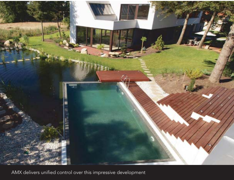
AMX delivers unified control over this impressive development